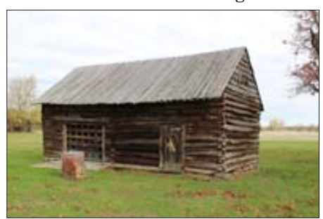
The Swedish Granary.

We started by going to the "Swedish Granary" in Greenwich, by the Maurice River, at the southernmost point of New Jersey. We had seen pictures of that house and now we hoped to find that it had been built in the Nordic manner. At a distance it looked so, but this building was also built without the sealed log walls.