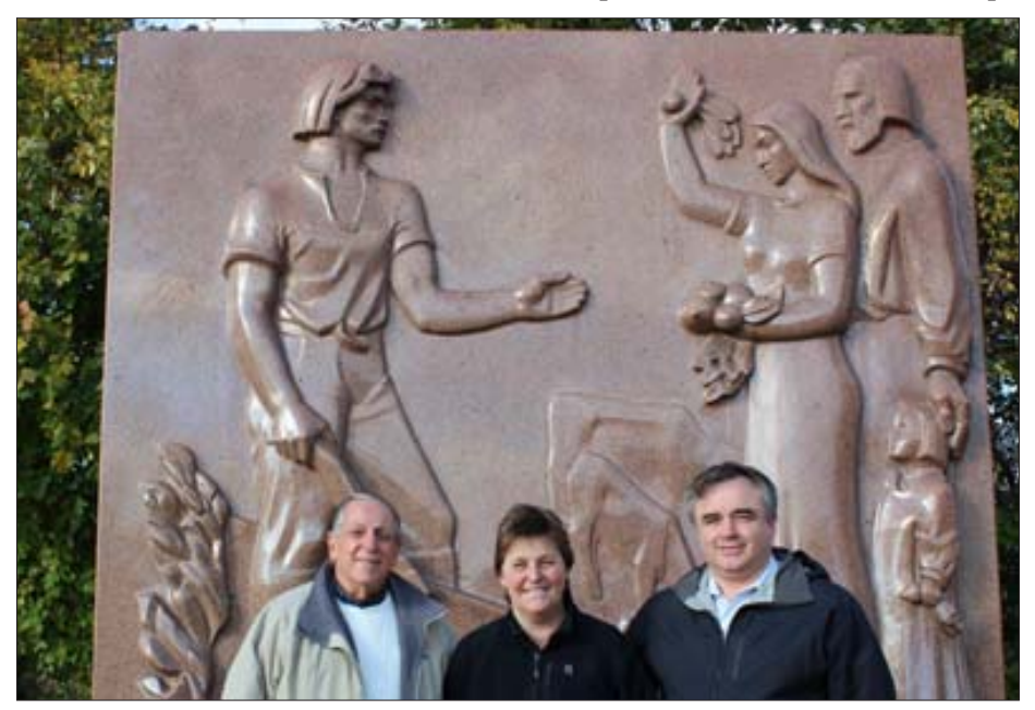
The Finnish Settlers Monument, by Väinö Aaltonen, first inaugurated at the 300th jubilee in 1938. It is located in Chester, Pennsylvania.

The next stop was the open air museum "New Sweden Colonial Farmstead" in Bridgeton City Park (NJ), which was built for the 350th anniversary celebration of New Swe-