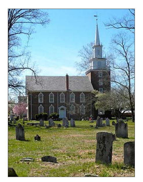
Old Swede's Church, Swedesboro, New Jersey.

Today we picked up our rental car. Even though it had a GPS, it did not take many minutes before we were lost. After a few days we understood the American system of signs and