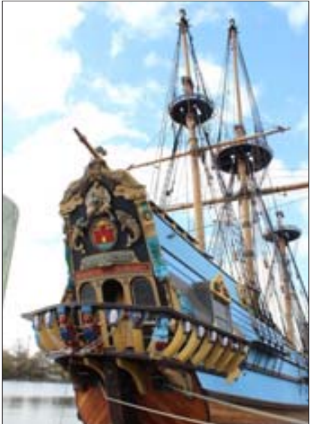
Tuesday Nov. 6

Just behind the shipyard we found "Fort Christina." Today there is nothing to see from the fort, but a wide avenue leads to a big monument where it is supposed to have stood. The place was chosen originally because the stable bedrock made it a safe place to descend from the ships